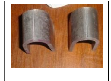
Laser Welded 9Cr1Mo plates after bend test